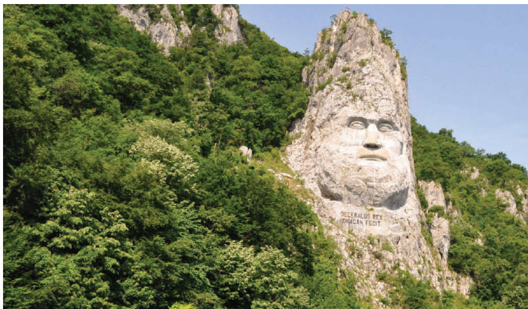
Decebal's head carved in rock, Iron Gates Natural Park, Romania

Early this morning we sail out of Budapest towards Kalocsa, one of the oldest towns in Hungary, famous for the production of paprika. This afternoon visit a local Puszta Horse