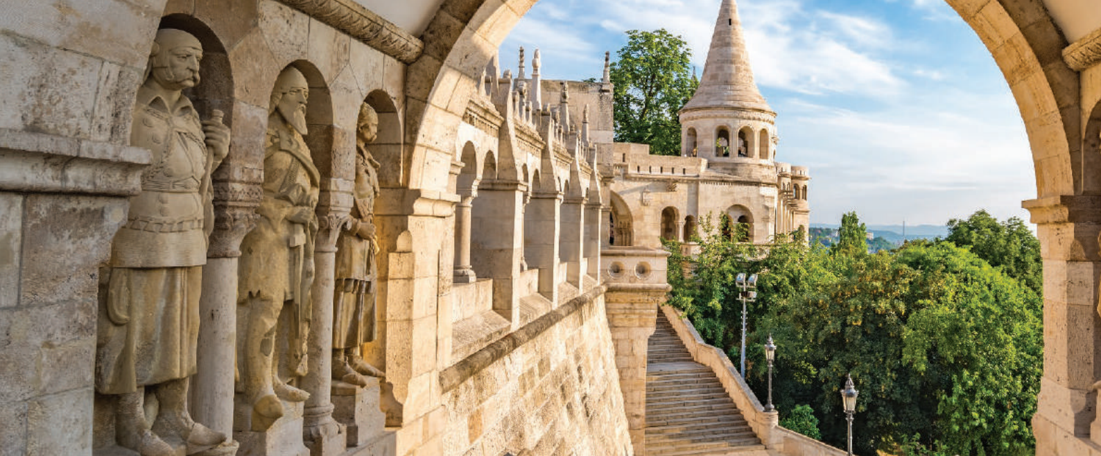
Fisherman's Bastion, Budapest, Hungary