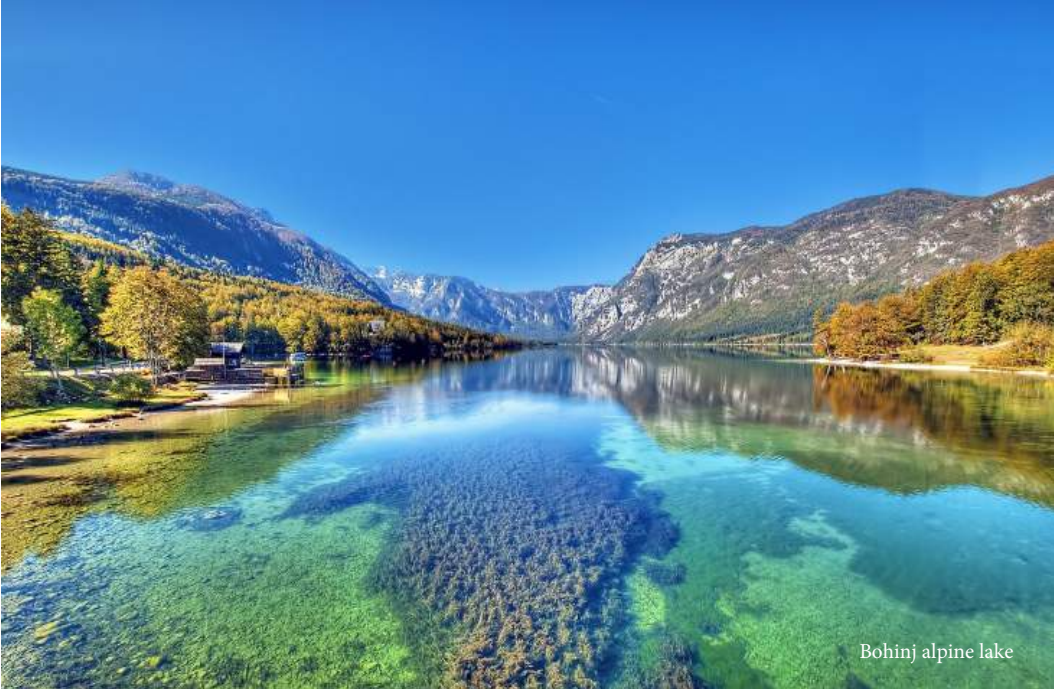
Bohinj alpine lake

Slovenia is our destination today. Soon after crossing the border between Croatia and Slovenia we arrive in Lipica, the home of the famous Lipizzaner horses.